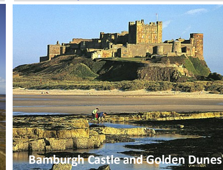
Bamburgh Castle and Golden Dunes