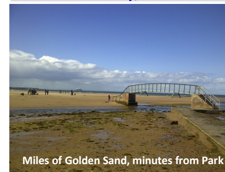
Miles of Golden Sand, minutes from Park